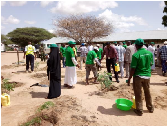
Tree planting exercise by leaders and community

The world environment day for 2017 was commemorated in Dadaab on the 5 th June 2017. There was wide participation in the event that included the agencies, host community, refugee and host local schools and community leaders. The event was graced by the area Member of Parliament and the UNHCR head of operations.