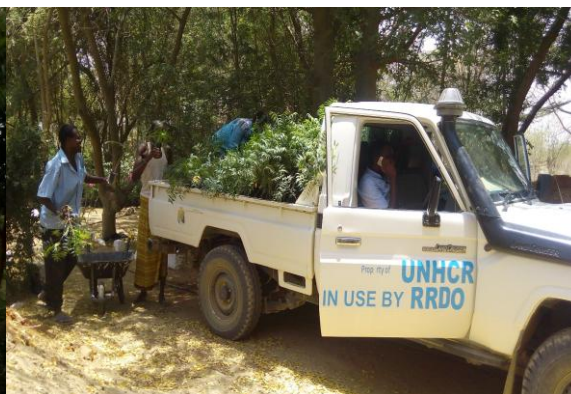
Distribution of seedlings