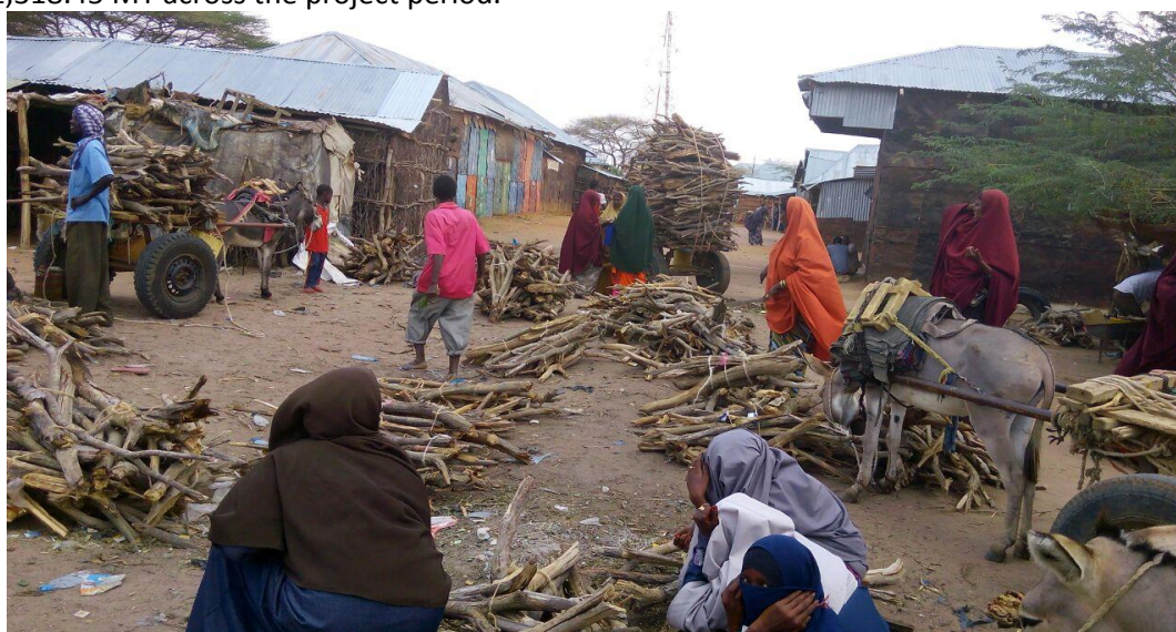
Household Distribution of firewood to targeted households Dagahaley

Note: The households that received in the first round are the same households that received in the second round. Therefore, 15,487(14,080 and 1,080 flood affected) households received a total of 1,318.45 MT across the project period.