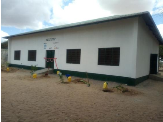
View of the renovated dining Hall

This activity was completed in the month of July. The renovation works included new flooring, extension of the height of the walls, plastering and painting as well as new roofing. Upon completion, the hall was inaugurated on the 2 nd August 2017 by the area Member of Parliament Hon. Dr. Mohammed Dahiye. The facility has also been equipped with desks, tables and energy saving institutional stoves.