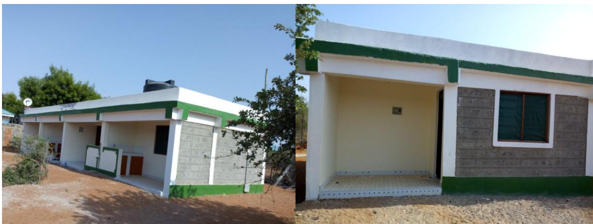
A 5 roomed accommodation block at Dadaab Secondary School

Dadaab Secondary School has crisis of teacher's accommodation. The teachers live in a structure that initially was student's dormitory. It is small, squeezed up, no ventilation and with no privacy. The 5 teachers roomed teachers block was completed in December 2017 and it is now offering decent accommodation for 5 teachers.