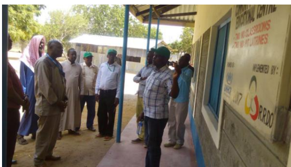
RRDO Project Manager briefing about the class