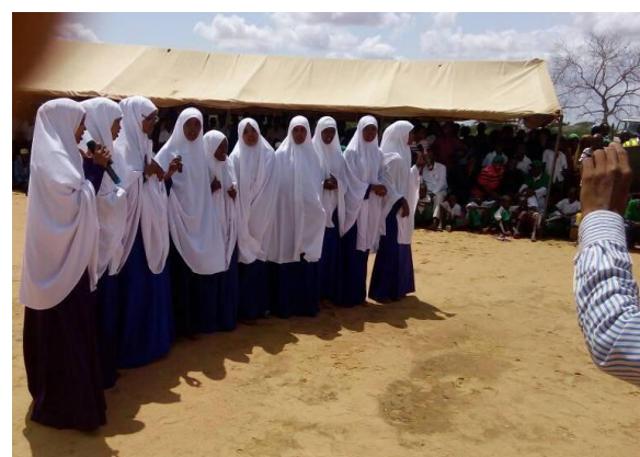
Performances by Toufiq Primary and Hagadera Secondary School respectively