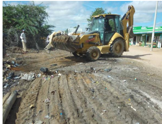
Dadaab town clean up exercise

The actual commemoration was held at Dadaab Primary School where the chief Guest was the area MP and co quest was UNHCR Head of Operation. Other Guests include area MCA, RAS and Heads of Agencies.