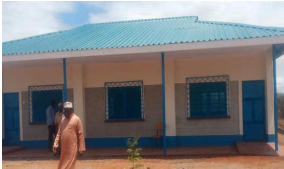
Completed ICT Classroom awaiting equipping

Agreement Symbol: <insert data from PPA Art. 4.2>