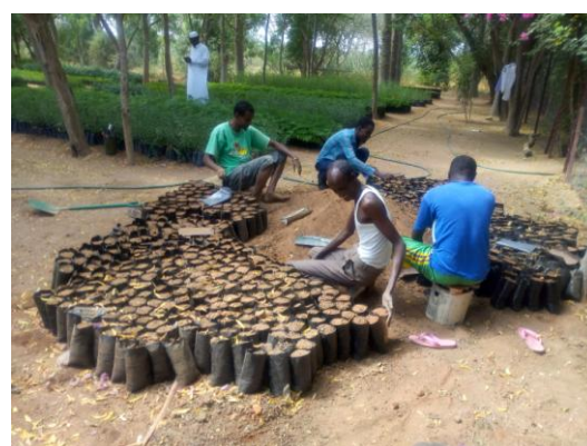
Production of seedlings in the three nurseries