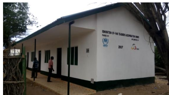
Renovated 4 roomed block