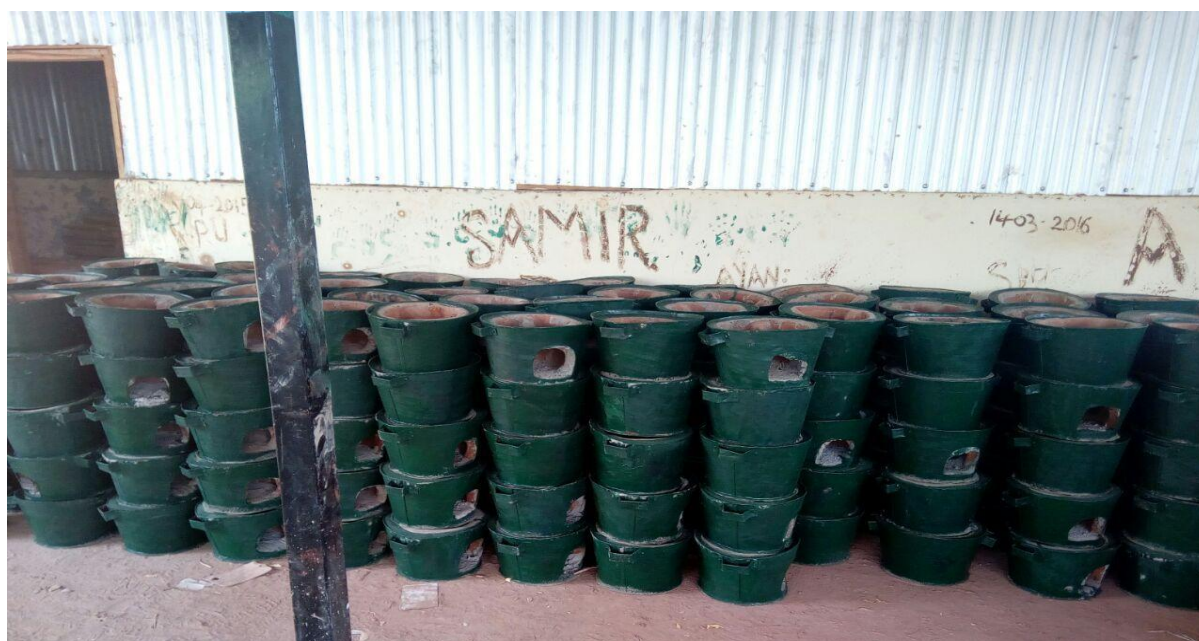
Fabricated stoves at the RRDO stove Production unit

Dagahaley Camp – 1,100 pieces, Ifo2 camp – 1,100 pieces, Ifo1 Camp – 1,100 pieces, Hagadera camp through FAIDA, 1,050 pieces and Dadaab host community – 650 pieces