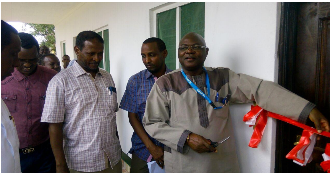
UNHCR Head of operations opening the 4 roomed accommodation block with the MP