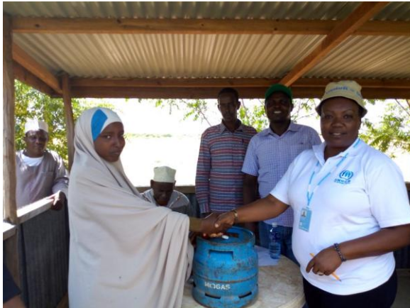
Senior Programme Officer handing over LPG to a beneficiary

The tendering process took place in the first quarter of the year where a supplier was identified and selected. During the reporting quarter, 3,180 Kgs were distributed to the beneficiaries. This gives a cumulative total of 5,220 Kgs of LPG distributed across the project period. In the last quarter of the project, 454Kgs were distributed in October while 1,326Kgs were distributed in November. All the 160 HH are from Ifo2 camp.