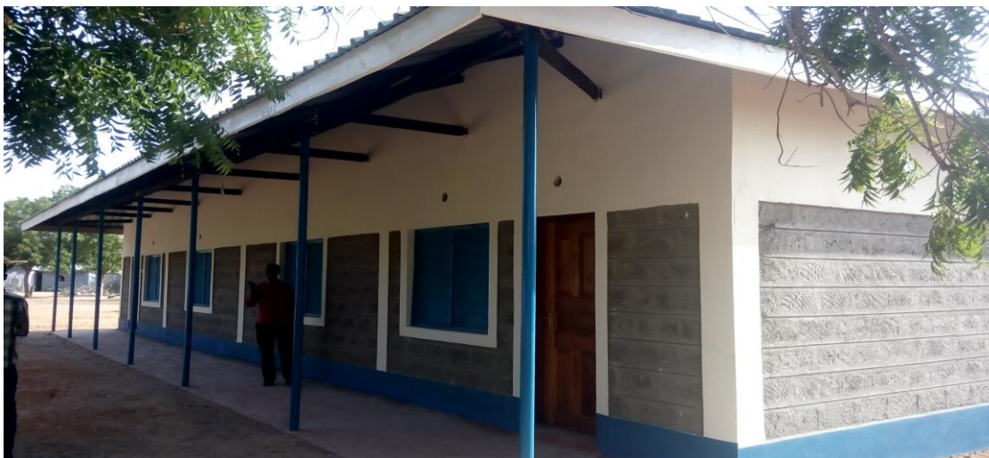
Completed 2 classrooms at the Dadaab Integrated Learning Centre

The Dadaab integrated educational centre focuses on Early Child Development (ECD) within Dadaab Township. Having began in 1992, the centre currently has 350 children (200 boys and 150 girls). The challenge that the center has faced over time is inadequate infrastructure including classroom, toilets, and lack of clean water. The two new classrooms now accommodate 30 pupils each who have conducive learning environment. We expect that the resulting impact of these facilities will be improved educational performance and childhood development.