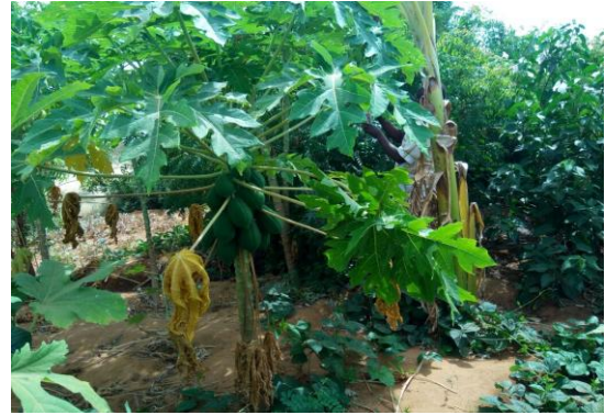
Mangoe trees and assorted fruits and vegetables at the green belt Ifo2

6 Location Environment Committee (LEC) meetings were held regularly across the project period in the camps as well as host community. The meetings brought together the refugees including their representatives as well as agency representatives. The purpose of these meetings was to sensitize partners on the issues of environmental conservation and how to synergize each other on the same matter. Some of important resolutions of these meetings were that the refugee community will work together with the host community to ensure that rampant environmental destruction is minimised. As result of these meetings, the refugee and host community have played an active role in the protection of the environment particularly stopping degradation.