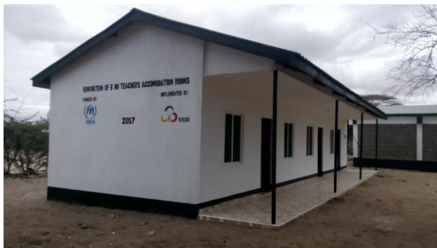
Renovated 3 roomed block

Dadaab Primary is the biggest primary school in Dadaab Sub County with a population of 502 students (299 boys and 203 girls). The school has 17 full time teachers (6 female and 11 male). The biggest challenge of the school has been inadequate poor accommodation facilities for teachers. Some of the accommodation facilities that existed were very old and dilapidated and unfit for human habitation. The 7 rooms were part of the dilapidated accommodation facilities, having been constructed in late 1970s and early 1980s. Some of the rooms were old classrooms that were vacated. The 7 rooms that have been renovated into modern houses now provide conducive living environment for the 7 teachers and this will increase the morale for teachers. We expect that this motivation will translate to improved academic performance of the learners.