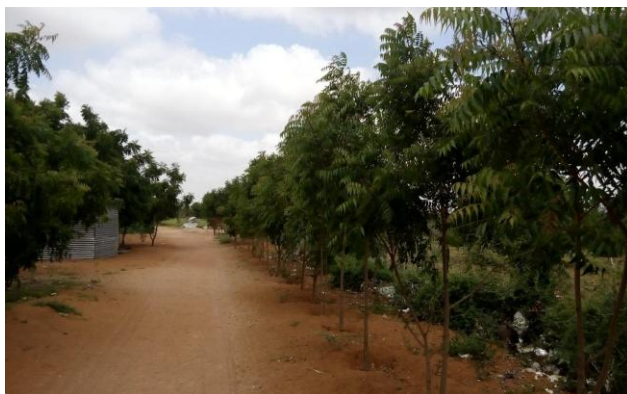
Trees planted at Towfiq Primary School