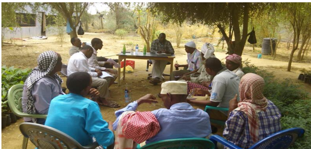
A LEC meeting at Ifo Camp

6 Location Environment Committee (LEC) meetings were held regularly across the project period in the camps as well as host community. The meetings brought together the refugees including their representatives as well as agency representatives. The purpose of these meetings was to sensitize partners on the issues of environmental conservation and how to synergize each other on the same matter. Some of important resolutions of these meetings were that the refugee community will work together with the host community to ensure that rampant environmental destruction is minimised. As result of these meetings, the refugee and host community have played an active role in the protection of the environment particularly stopping degradation.