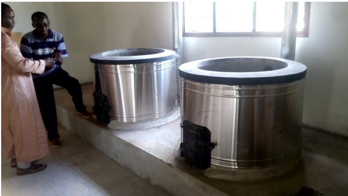
New Institutional energy saving stoves installed at the Dadaab Primary school dinning hall